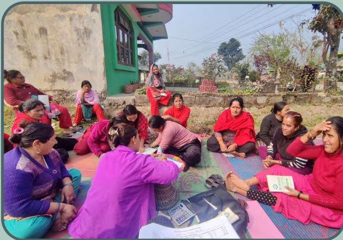
Monthly Community Meeting