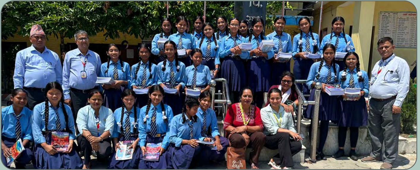
CVP Beneficiaries Receiving School and Educational Supplies