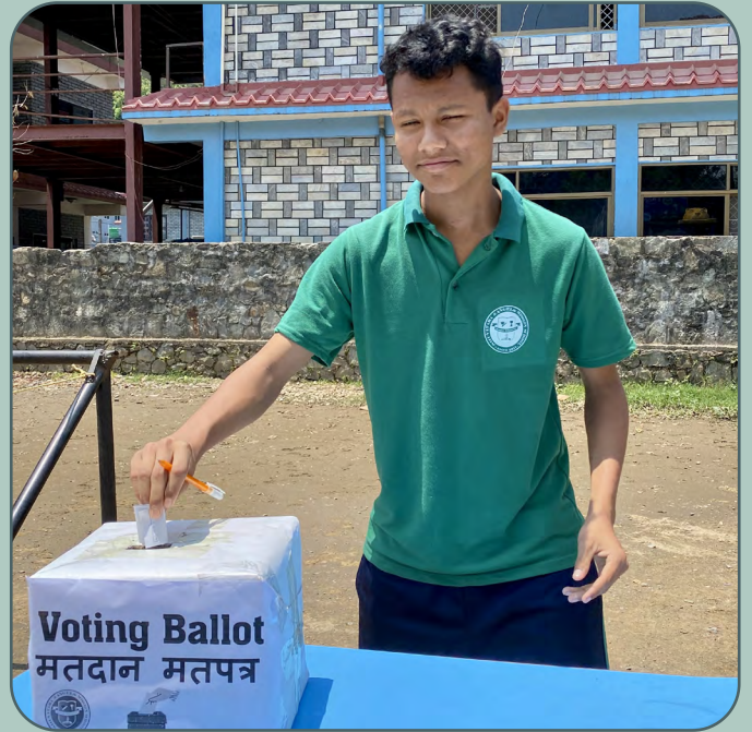
Election for School Student Officials