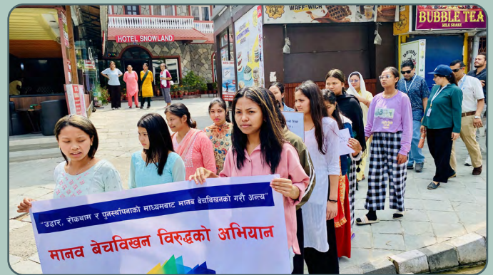
Participation in Awareness Rally.