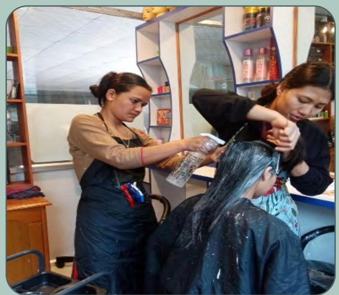
Beauty Parlour Training