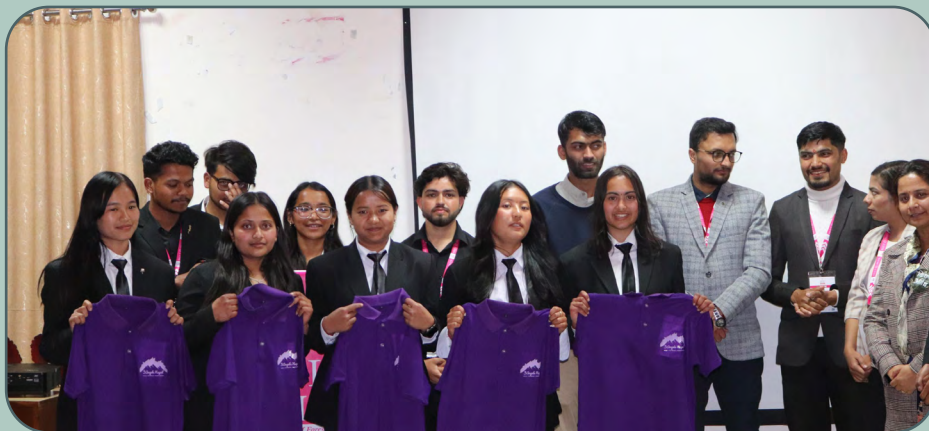
Prize Distribution to Winner

3ACR is established in 2012 with an aim to create mass awareness across the country as a preventative approach to combat trafficking. The radio reaches out to over 1.3 million population. The media house on the other hand is an initiative to present the awareness program to even large targeted population over the social medias.