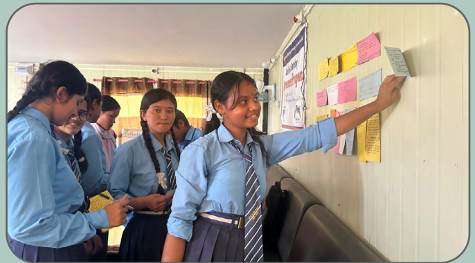
Career Counseling Distribution of Educational Materials