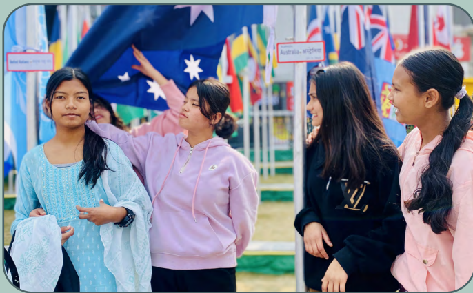
Visit to Flag