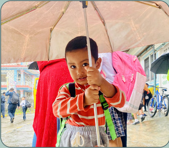
Going to School

The program provides comprehensive support to trafficking victims, especially to children and nursing mothers. Through safe shelter, education, and skills training, this program empowers survivors to rebuild their lives. Additionally, the program raises community awareness about mental health, women's rights and child protection to prevent future trafficking incidents.