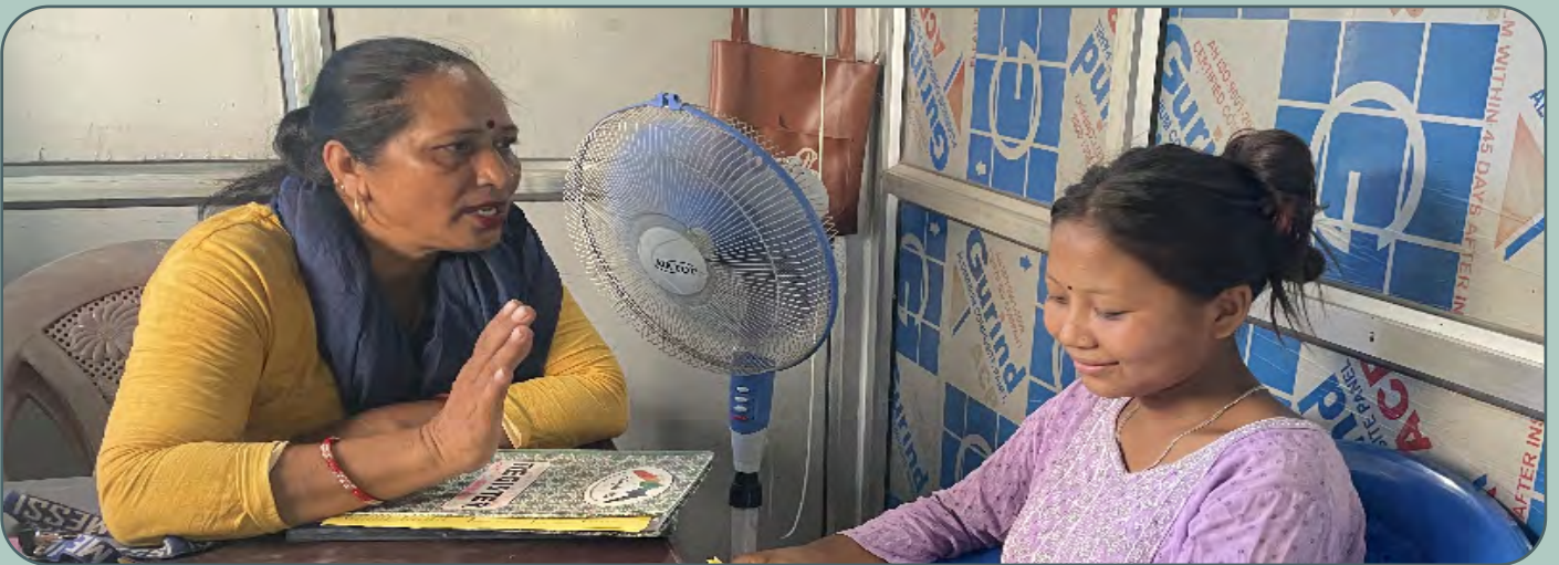
Investigation and Documentation at the Borders