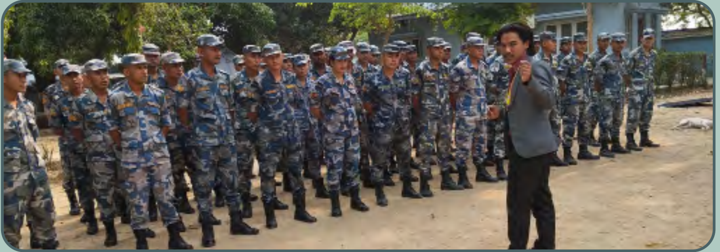
Training APF Against Human Traffick-