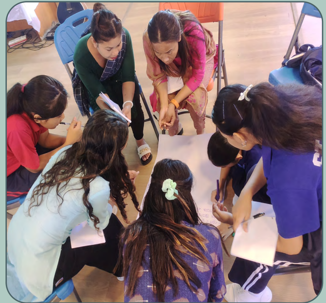
Reproductive Rights Awareness