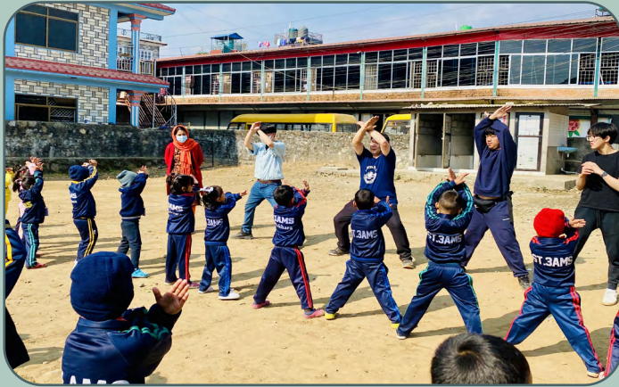
Self-Defense Training for Kids