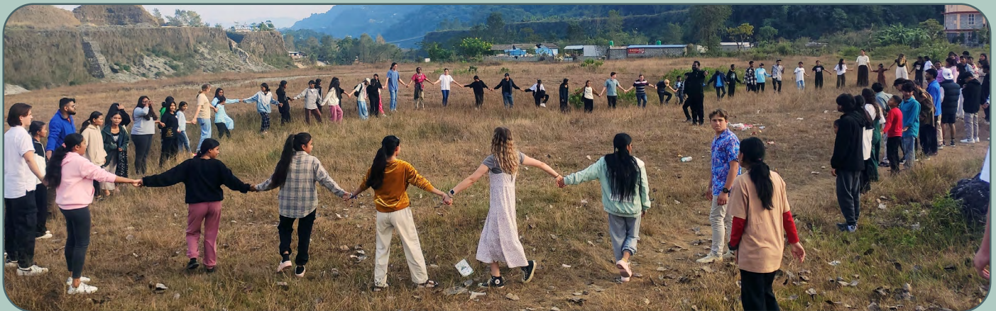
Outing in the Nature