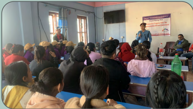
Interaction Program with Local Government