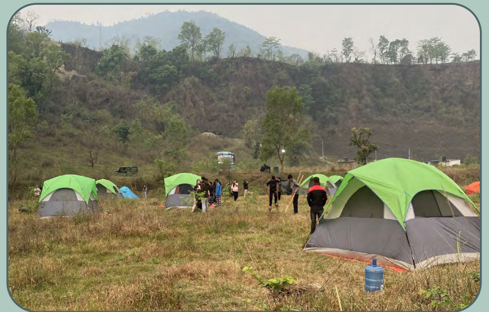
Pathfinder Activities: Camping