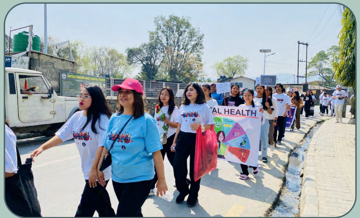
Rally on Mental