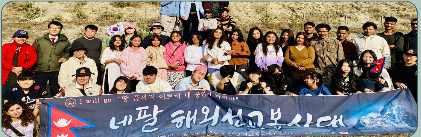
cultural Exchange program