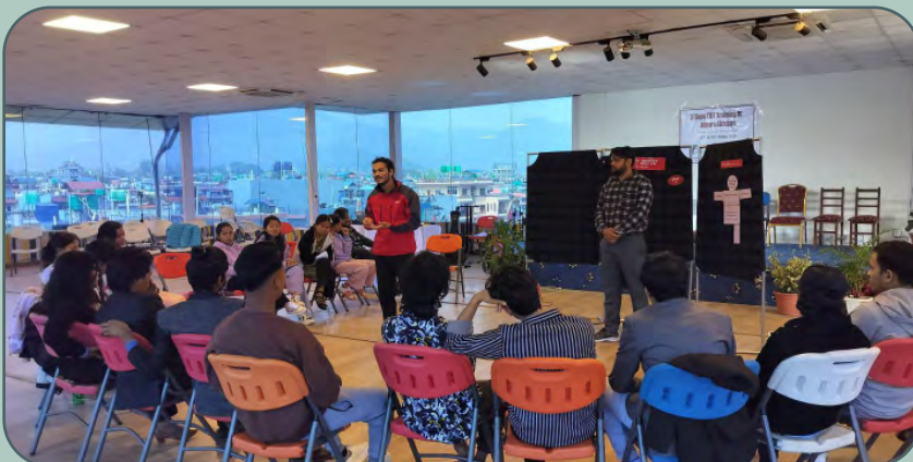
Awareness Via edutainment