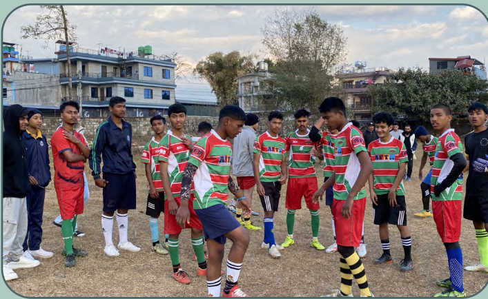
Interschool Football Tournament