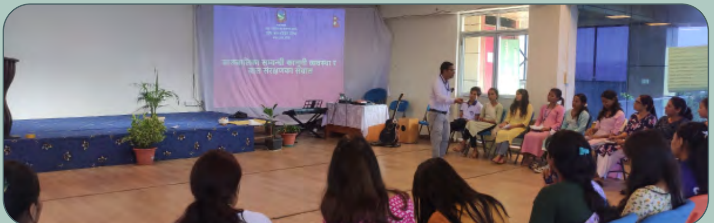
Awareness on Child Rights by Child Rights Specialist.