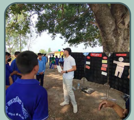
Our Body Station

Hamro Abhiyan is a youth-driven initiative in Nepal designed to combat human trafficking, focusing on the vulnerable age group of 12-35. It actively engages schools, the army, police, and border security forces as key stakeholders. This year, tertiary students organized 56 events as part of Hamro Abhiyan to raise awareness and prevent trafficking.