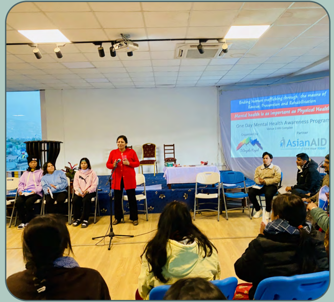
Mental Health Awareness

The program provides comprehensive support to trafficking victims, especially to children and nursing mothers. Through safe shelter, education, and skills training, this program empowers survivors to rebuild their lives. Additionally, the program raises community awareness about mental health, women's rights and child protection to prevent future trafficking incidents.