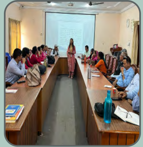
Awareness in Community