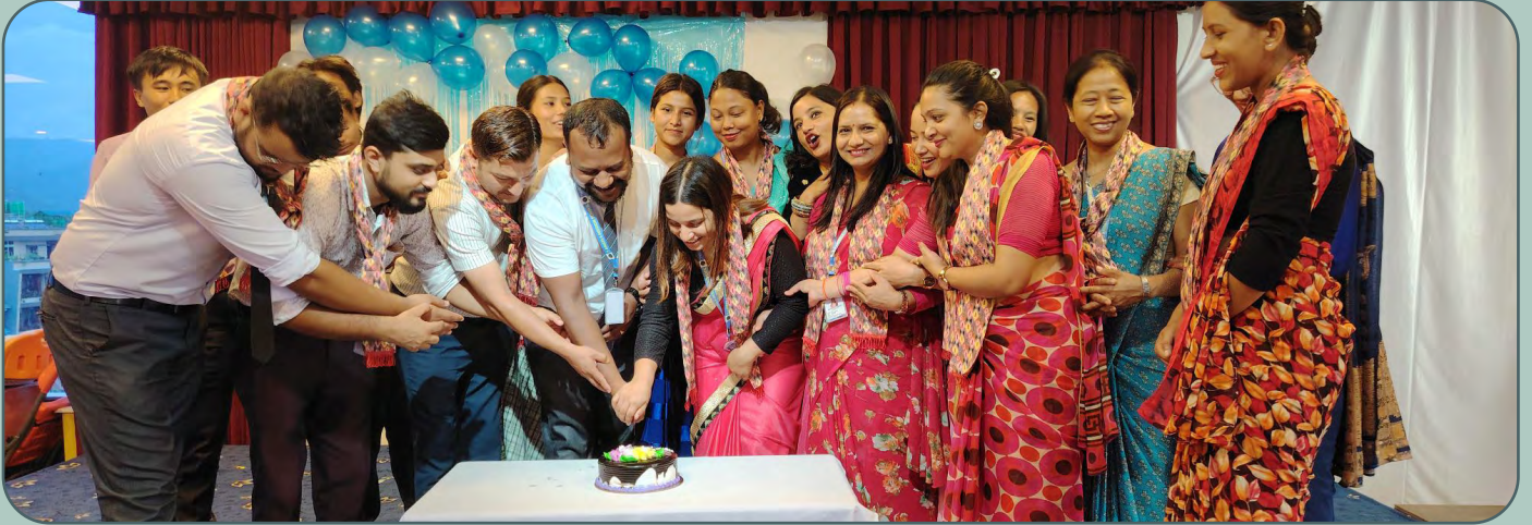
School Teams of Teachers